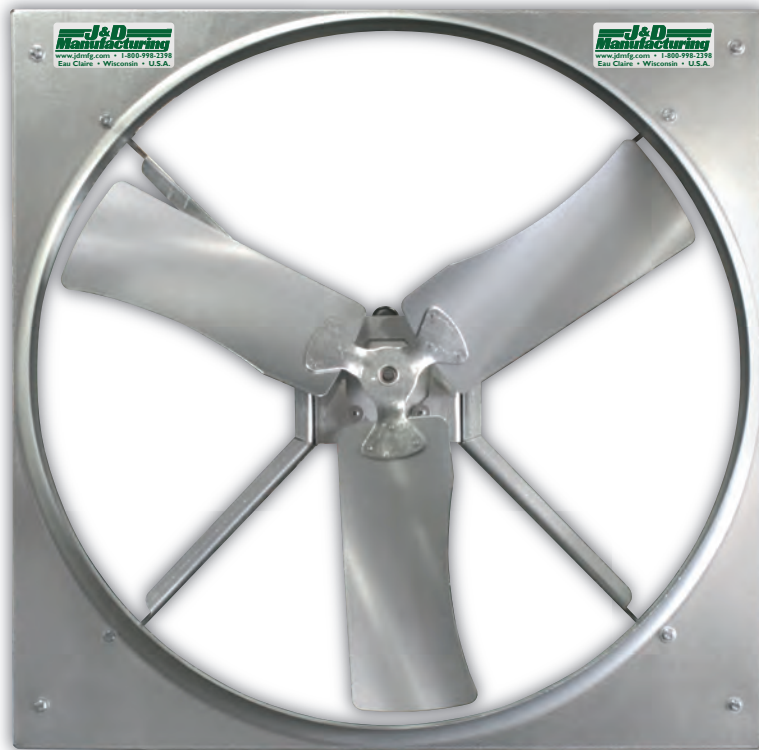
36" Direct Drive 3-Blade Panel Fan

The cushion-mounted maintenance-free bearings and heavy-duty automatic belt tensioning system on belted models make this fan high performing, low maintenance, and a great value.