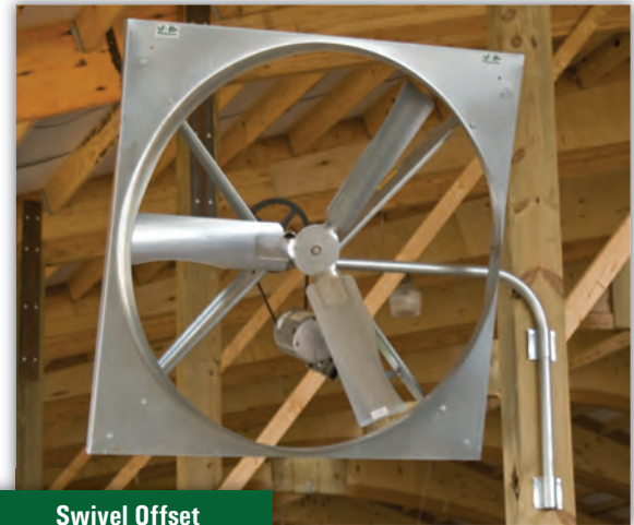
Swivel Offset Wood Post Mount for Belt Drive Panel Fans