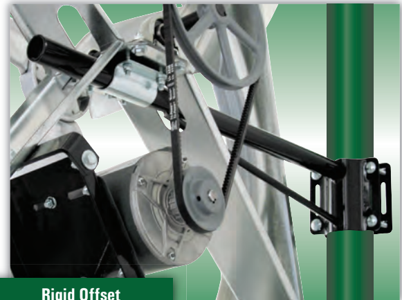
Rigid Offset Column Mount Bracket for Belt Drive Panel Fans