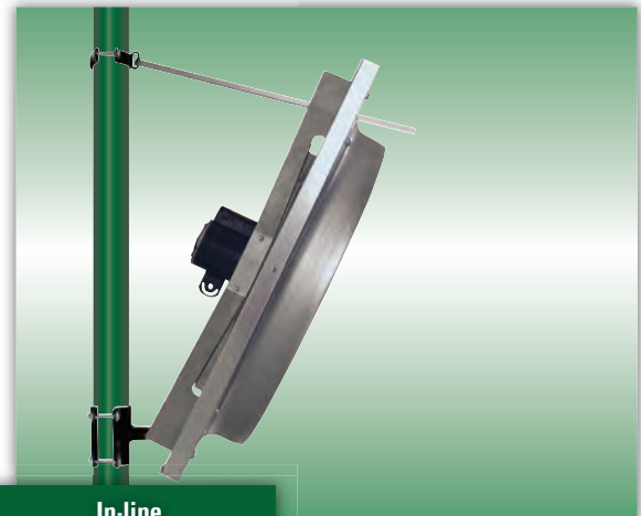
In-line Column Mount Bracket for Direct & Belt Drive models of Panel Fans

⚠ WARNING: This product can expose you to chemicals including lead, which is known to the State of California to cause cancer and birth defects or other reproductive harm. For more information go to www.P65Warnings.ca.gov/product .