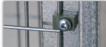
Poly guard clips to reduce vibration for quiet performance.