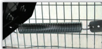
Heavy duty spring belt tensioner on belt drive models to reduce bounce at startup.