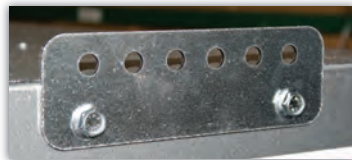
Attached hanging brackets for easy installation.