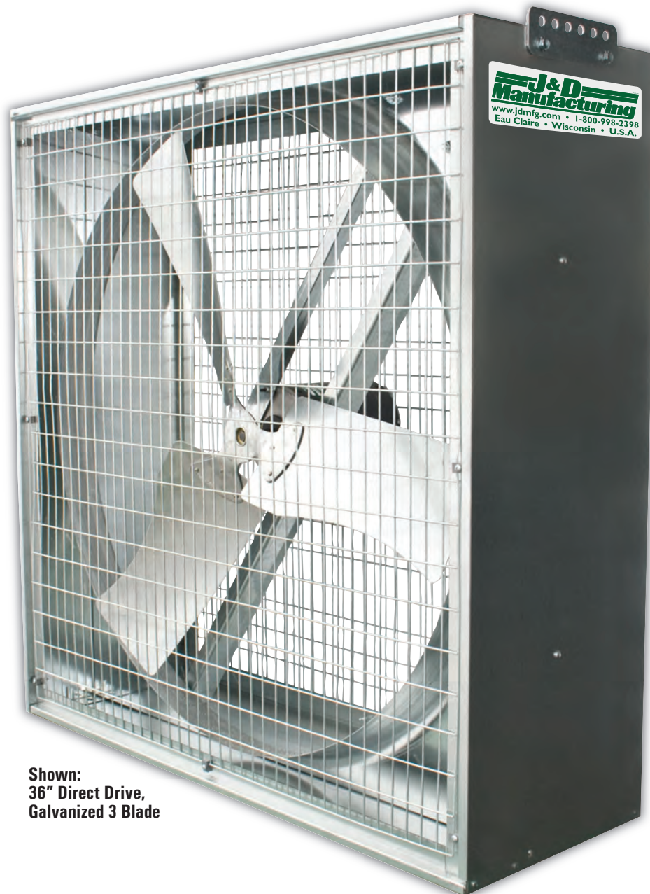
Shown: 36" Direct Drive, Galvanized 3 Blade

⚠ WARNING: This product can expose you to chemicals including lead, which is known to the State of California to cause cancer and birth defects or other reproductive harm. For more information go to www.P65Warnings.ca.gov/product .